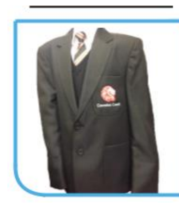
Step 12 Now get dressed