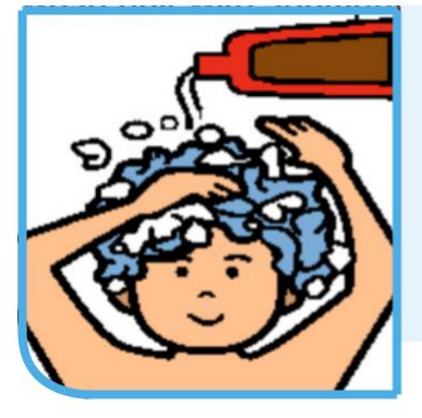
Step 3 Wash hair with shampoo