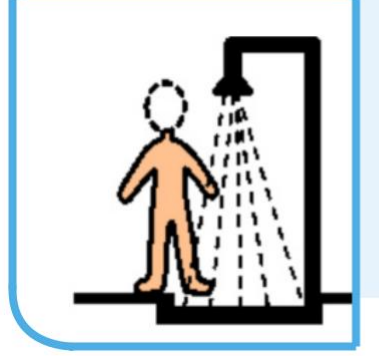
Step 2 Get into shower