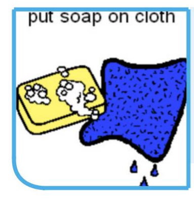
Step 4 Put soap on cloth